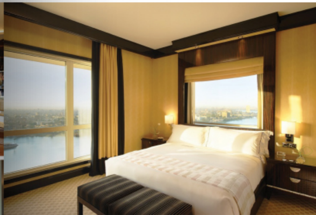
Above: Even the headboard in the Nile Suite bedroom gives guests a glimpse of the Nile. Opposite page, clockwise from top left: A staircase leads to the second floor of the Gold Lounge; river-side seating in the lobby lounge; cream furnishings and wood floors and walls make up the Gold Lounge; and communal dining and the main dining room of Saigon Bleu.