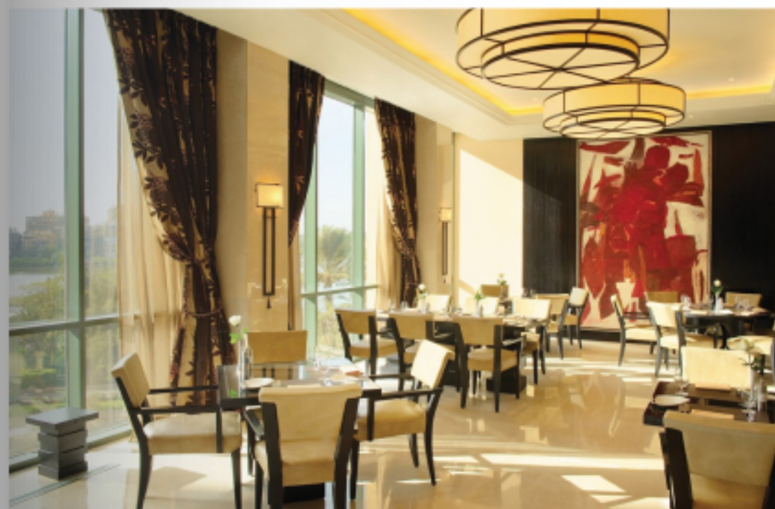
From top: The Gold Lounge's library at the Fairmont Nile City; a dramatic piece of art is the focal point of the Naga Grill dining room. Opposite page, from top: Three bronze "worker" sculptures stand in the reception area; the city Oryx Lounge.