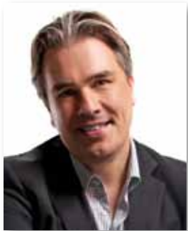
Carr: Combining historic appeal with contemporary luxury

Shanghai's recent building boom has restructured its relationship with architecture. China's commercial capital has furiously expanded skywards and the towers thronging both sides of the Huangpu River offer a visual metaphor for its economic ambition.